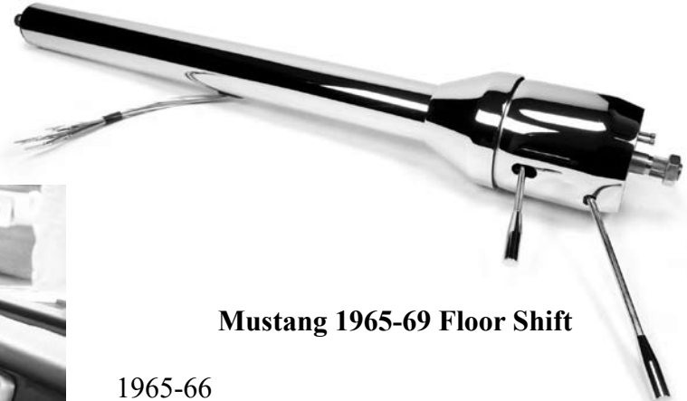
Mustang 1965-69 Floor Shift

Steel-1540760010-$1063 Chrome-1540760020-$1255