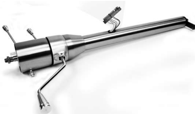
Tilt 2 1/4 in dia Column Shift w/column dress up kit