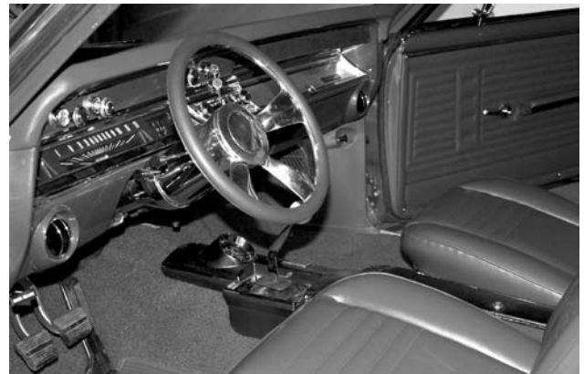
Chevelle/El Camino/GTO 1964-72