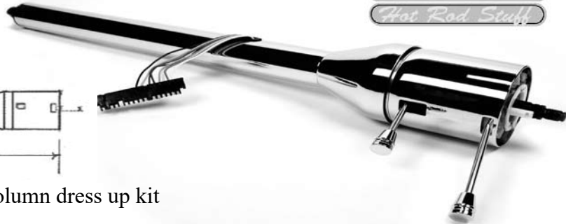
Tilt 2 in dia Floor Shift Column w/column dress up kit