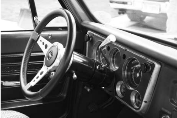
Chevy Truck 1947-78